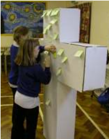
Adding our prayers to the cross

“I learnt about a cairn. I didn’t know what that was before”