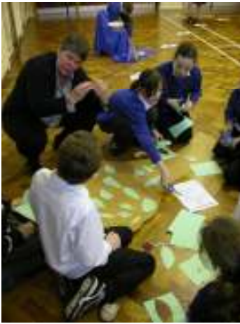
“Agony in the garden”