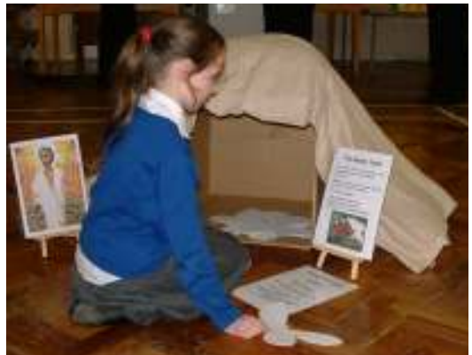
“The empty tomb” - Christ is risen!

“I learnt about a cairn. I didn’t know what that was before”